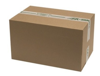
Cartridge incl. smoke comp.